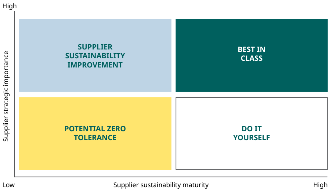
Exhibit 1: Supplier sustainability matrix

A global electronics company has developed an ROI-driven segmented approach that maximizes the impact of its sustainability development actions. It put this in place after finding that its earlier one-size-fits-all approach yielded disappointing results. In its new approach, the company has used a supplier auditing system to group suppliers into four clusters. It uses a specific approach for each of the different clusters, where the suppliers most advanced in their sustainability journey are given greater incentives to stretch further (see Exhibit 1).